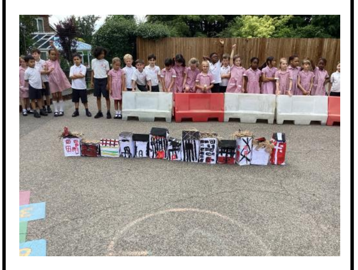
They also learnt about The Fire of London

This week, Year 2 visited Bromley Youth Music Trust to take part in a KS1 Song Festival. They were amazing at singing along with the other children from all the other schools.