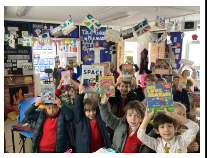
Y2 visited the library on Friday and had a wonderful time choosing books.