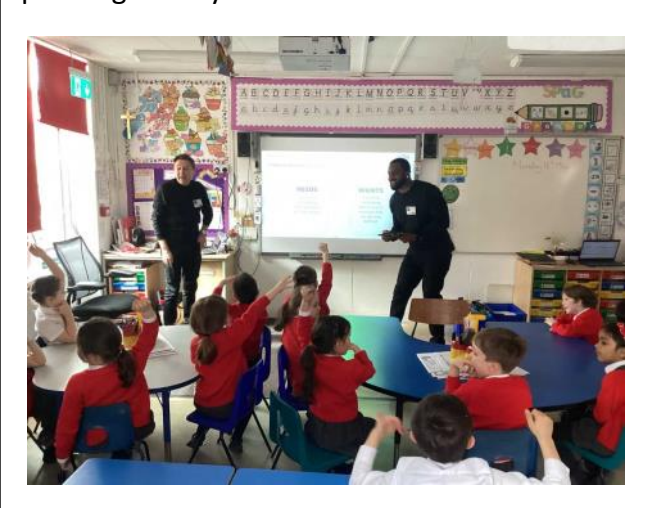
Year 2 learnt about budgeting and how it is important not to spend all our money but to save!

Year 1 looked at what is a need and a want when spending money.